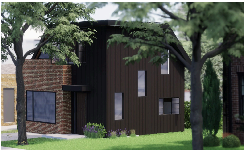
2-storey garden suite from Toronto's Eva Lanes - www.evalanes.com

The new building is a mostly-autonomous auxiliary dwelling unit, normally up to 6.0m (19.68 feet) tall, that cannot be legally severed from the main property, but is permitted a wide variety of uses, including as a revenue-producing (rental) unit. Where practical, some will have optional indoor vehicle parking.