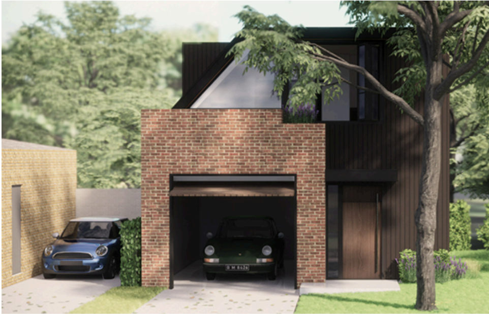
Single-vehicle garden suite from Toronto's Eva Lanes www.evalanes.com

The new building is a mostly-autonomous auxiliary dwelling unit, normally up to 6.0m (19.68 feet) tall, that cannot be legally severed from the main property, but is permitted a wide variety of uses, including as a revenue-producing (rental) unit. Where practical, some will have optional indoor vehicle parking.