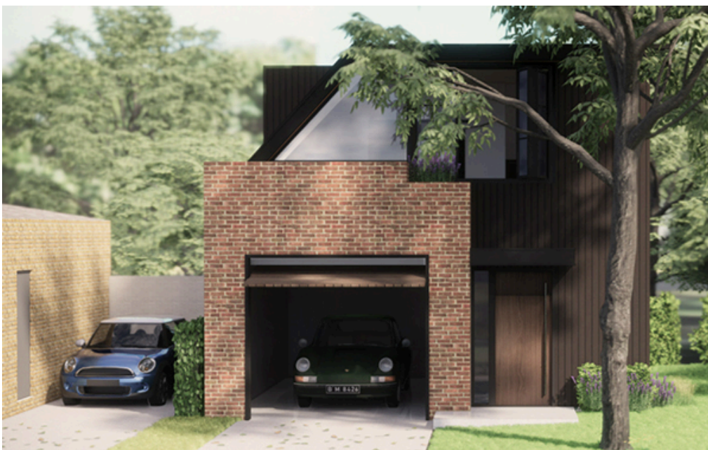
Single-vehicle laneway house from Toronto's Eva Lanes - www.evalanes.com

A basement is also possible, adding to the square footage above, but in most cases the floor plate of the basement will be significantly smaller than the ground floor and upper floors, the space cannot usually contain bedrooms or a bathroom or a kitchen, and the cost of basement construction can be significant.