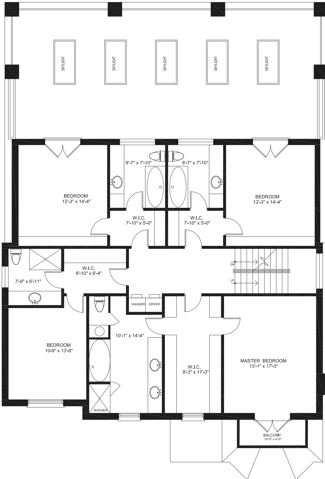
2ND FLOOR PLAN 1649 SQ. FT.