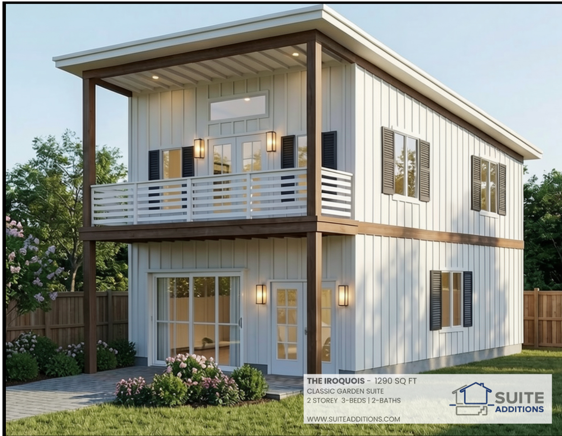
2-storey garden suite from Suite Additions .

minimum or maximum width or depth measurements, provided the footprint falls within the buildable area as outlined in grey above, all construction meets the provincial building code, and the footprint does not exceed 645.8 square feet. Walls with windows or doors must be placed at least 4.9 feet away from the respective property lines.